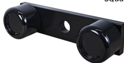
1347 Pivot & Rollers