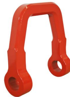
2310044C-01 Square Handle